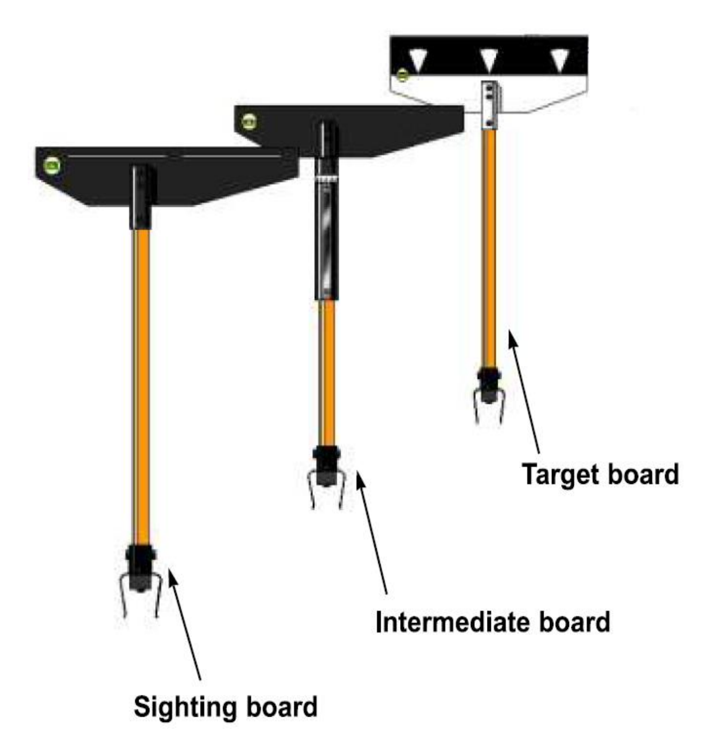
Figure 1 ABT4060 Sighting Board Set